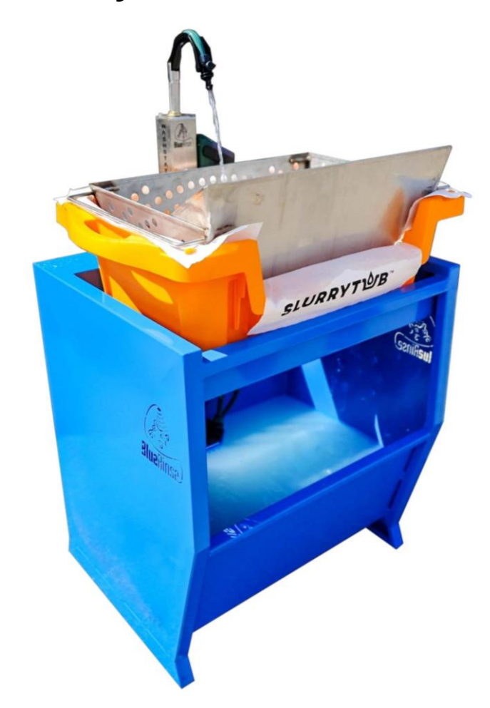
Hand Tool WashStation Instructions Leaflet