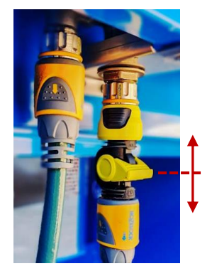
Adjustable Flow Valve